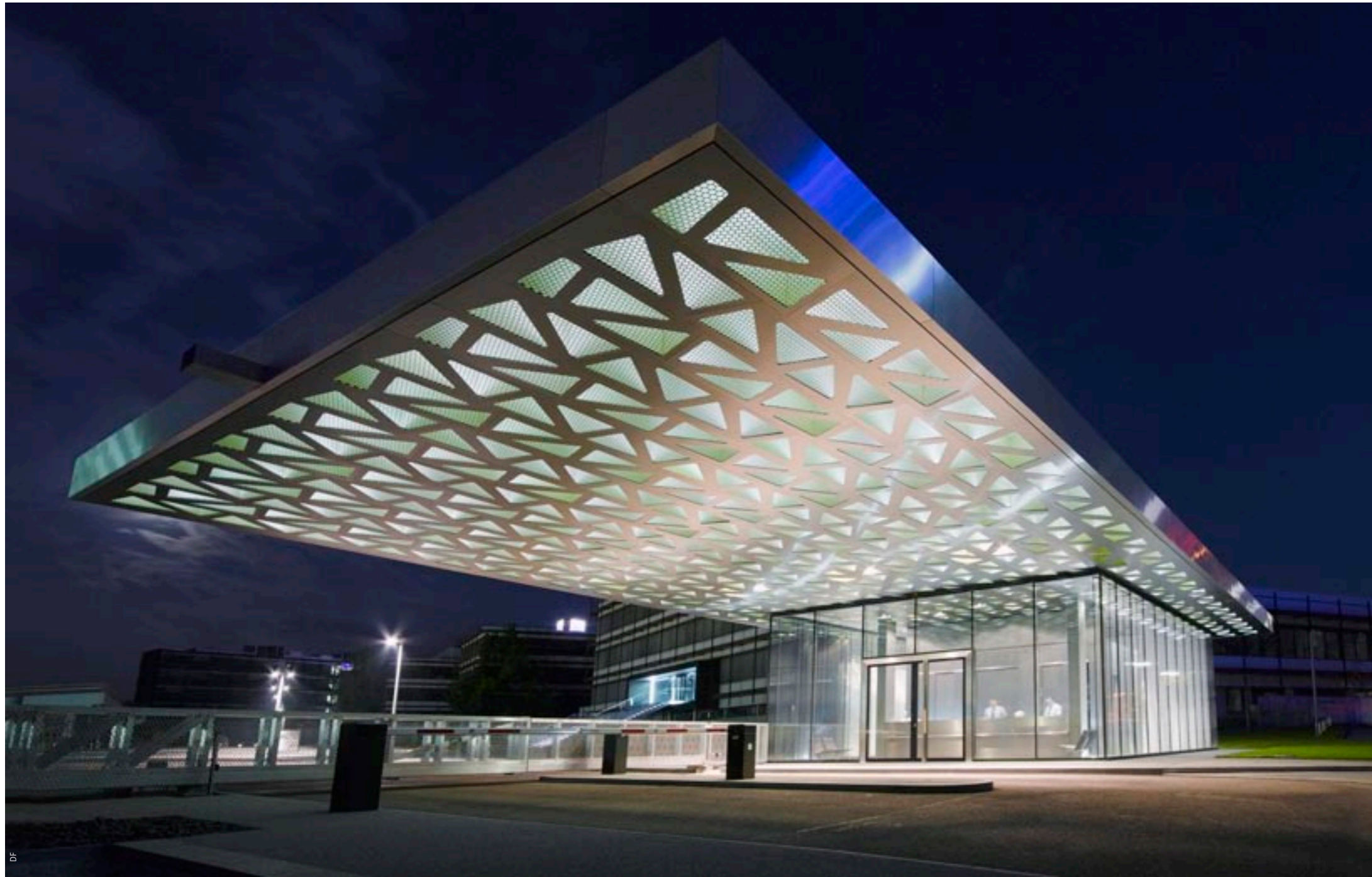
↑ The 32-metre-long roof with 20-metre cantilever is supported by only four pillars.